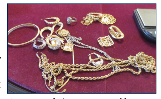
Approximately $2,500 in 14K gold

\textbf{813-244-4160} \, \bullet \, www. downsizing advisory service. com