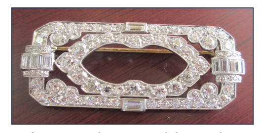
Tiffany & Co platinum and diamond pin Sold for an estate for $7,500