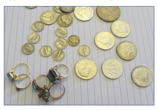
Silver dollars, half dollars, quarters and dimes before 1964 are worth at least 21 times face value.