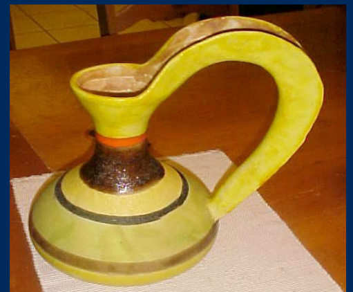
Guido Gamboni vase $2,015.