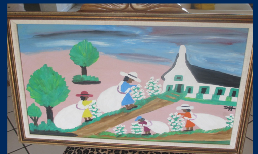
Clementine Hunter folk art $4,100.